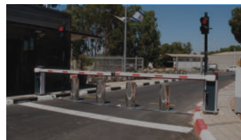
B3100 RATING K4