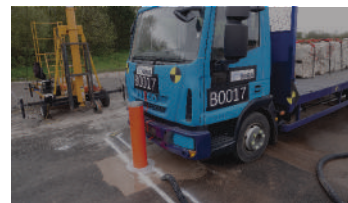
B3200 RATING K8