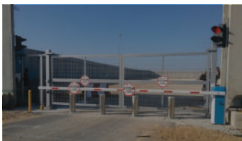
B3000 TRAFFIC BOLLARD