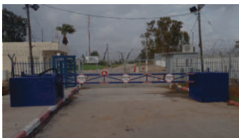
K6020 SURFACE AUTOMATIC BARRIER RATING K8