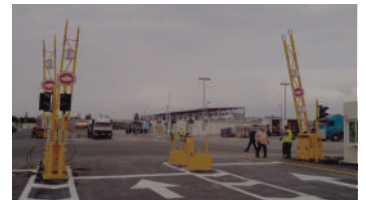
K6010 MANUAL DROP ARM BARRIER RATING K8