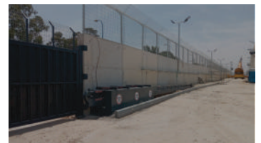
C440/C880 SURFACE MOUNTED BEAM RATING K4-K8