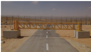
K3000 MANUAL SURFACE SWING GATE RATING K4