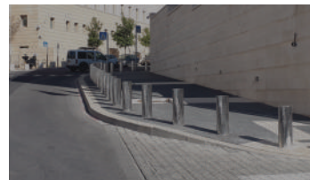
FXB6000- K12 REINFORCED CONCRETE DEEP FOUNDATION