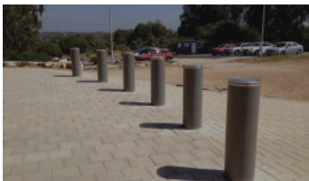
FXB5400- K4 REINFORCED CONCRETE DEEP FOUNDATION