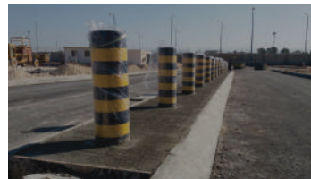
SFXB412- K12 SHALLOW FOUNDATION