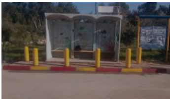
SFXB408- K8 SHALLOW FOUNDATION