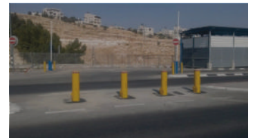
MANUALLY REMOVABLE BOLLARDS