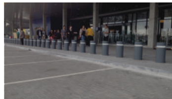
FXB5800- K8 REINFORCED CONCRETE DEEP FOUNDATION